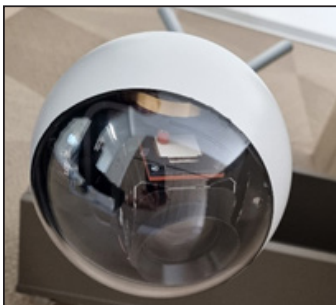
Television homing head TV/IIR HH 145 mm

Please note that the TV HH is usable only at daylight.