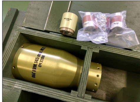
Armor piercing tandem charge WH with steel balls, 130 mm length, 10.5 kg mass, and a spare set of 1 WH and 2 TSCWH fuses