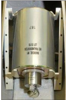
Combined enhanced blast and fragmentation WH with steel balls, 130 mm length, 10.5 kg mass BFWH