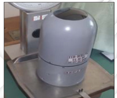
Thermal imaging homing head IIR HH 145 mm