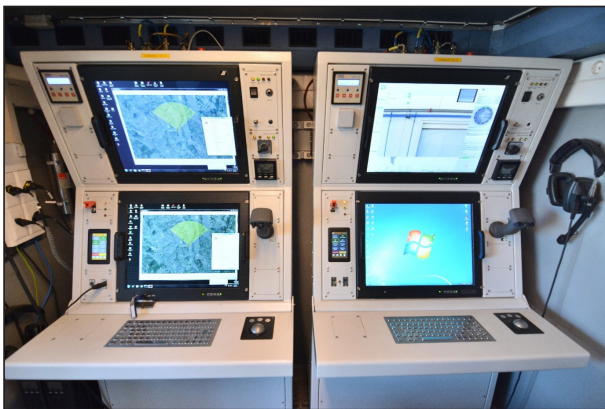
Two console type GCSs installed in a cabin that can be fit on a trailer or in a vehicle mounted housing.