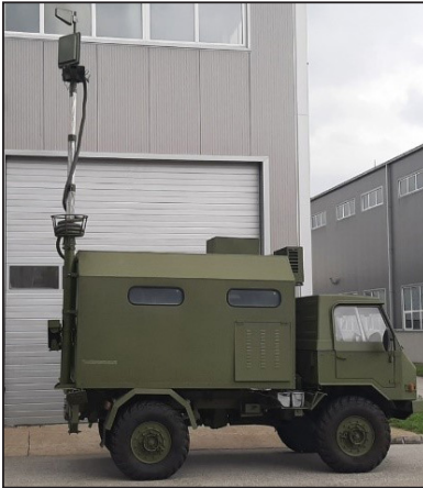
GCS with antenna system

Ground control station – GCS is used for launching, entering the flight profile data, guidance/control of the drone and the TV/IIR homing head.